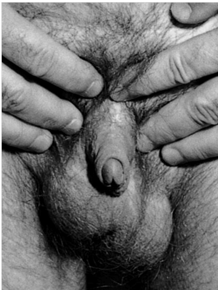
Metoidioplasty and testicular implants #1