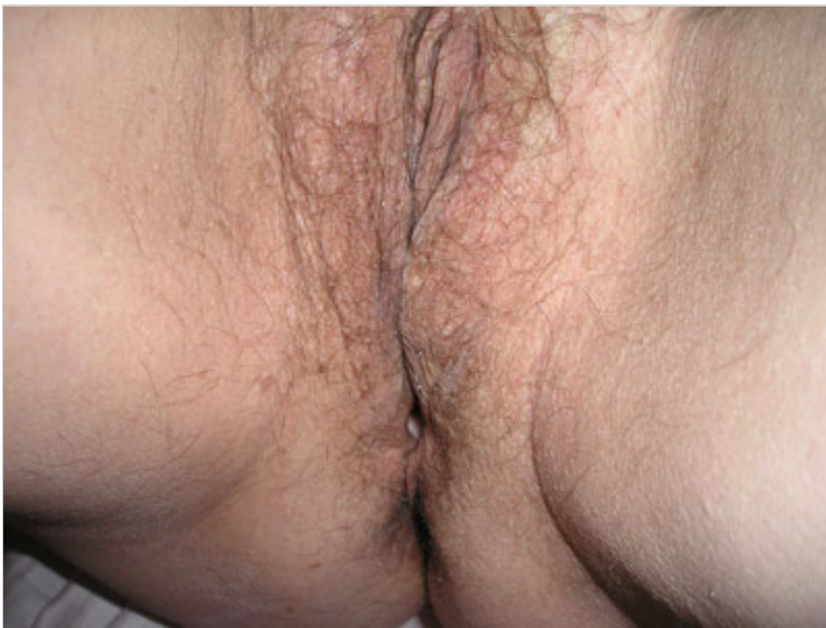
Vaginoplasty #3, 3 years post-op