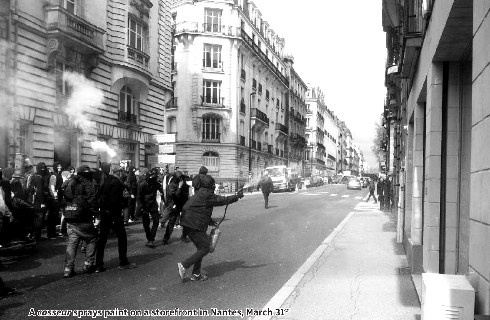
A casseur sprays paint on a storefront in Nantes, March 31 st