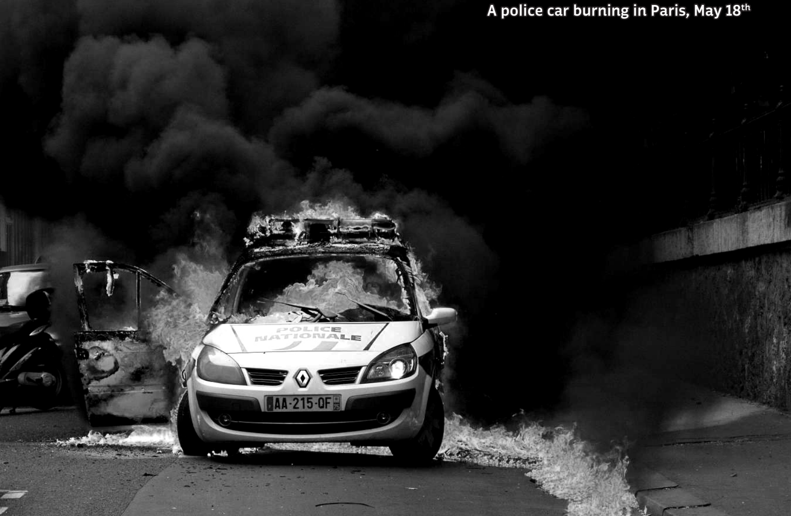
A police car burning in Paris, May 18 th