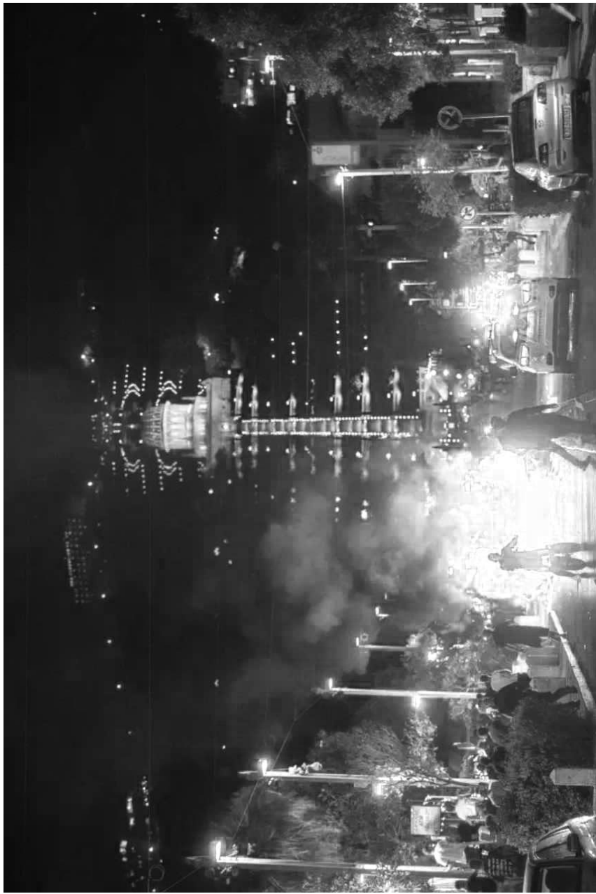
Haifa, May 2021.