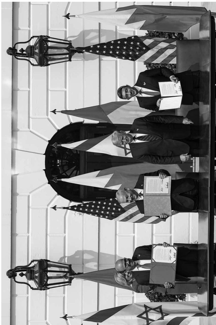
A utopia for reactionaries and weapon manufacturers, a nightmare for the peoples of the region.