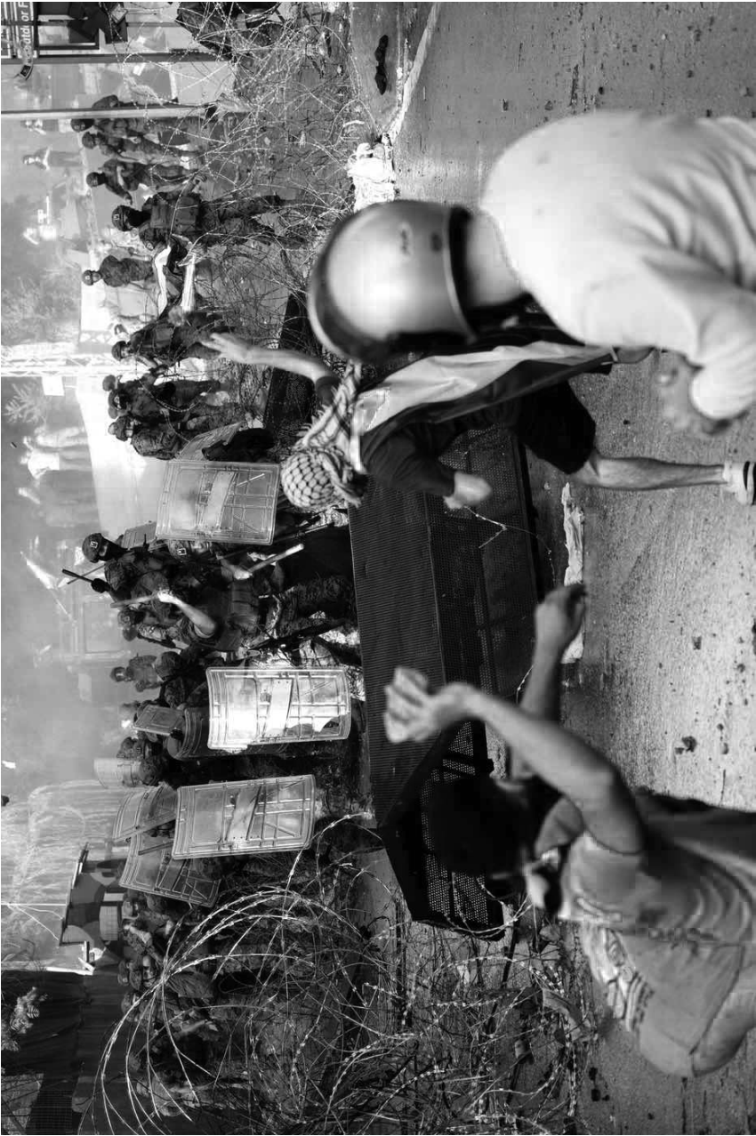
Protesters clash with the Lebanese army near the US embassy in Beirut on October 18, 2023. No regime is “pro-resistance.”