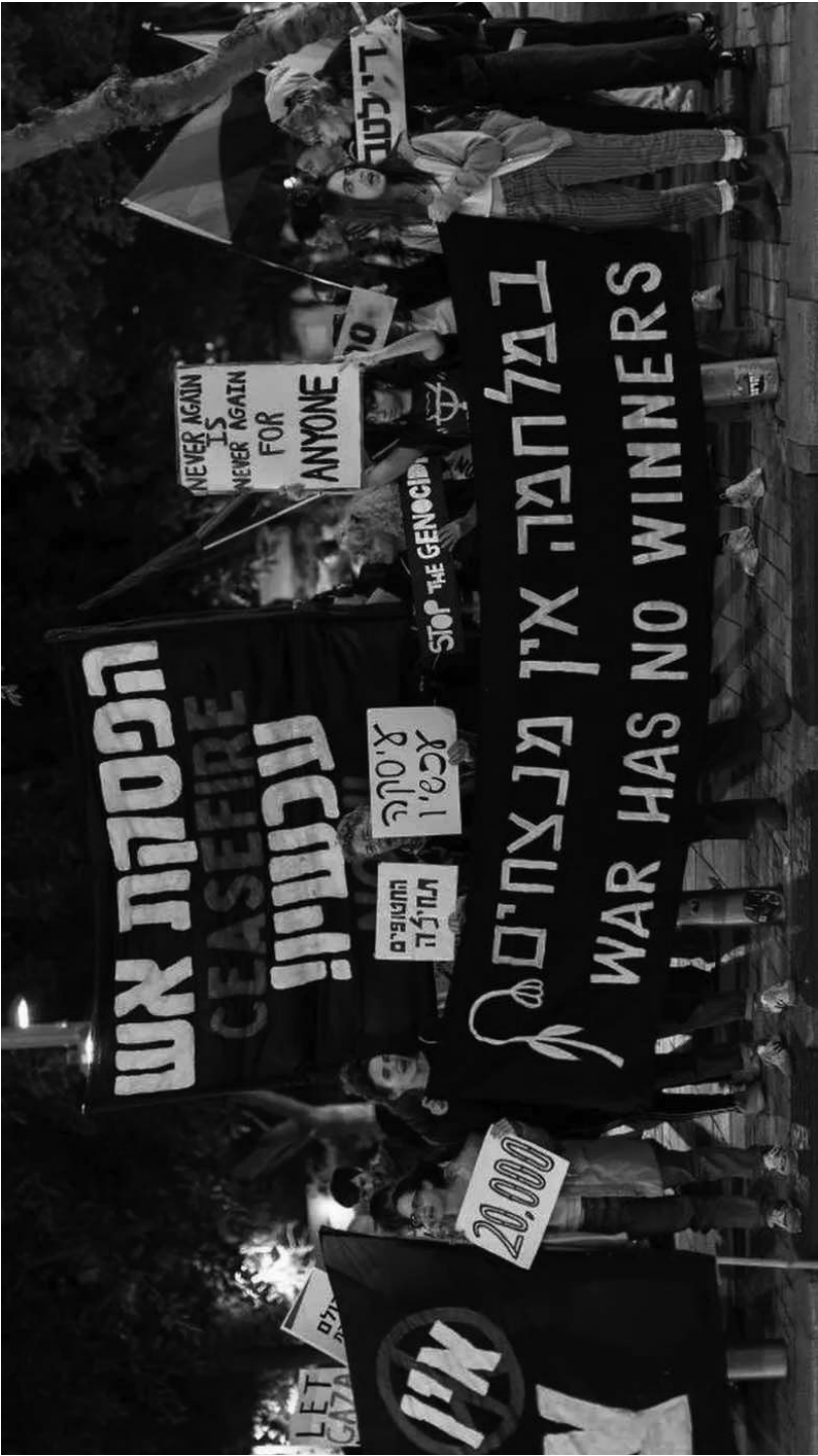
The Radical Bloc in Tel Aviv.