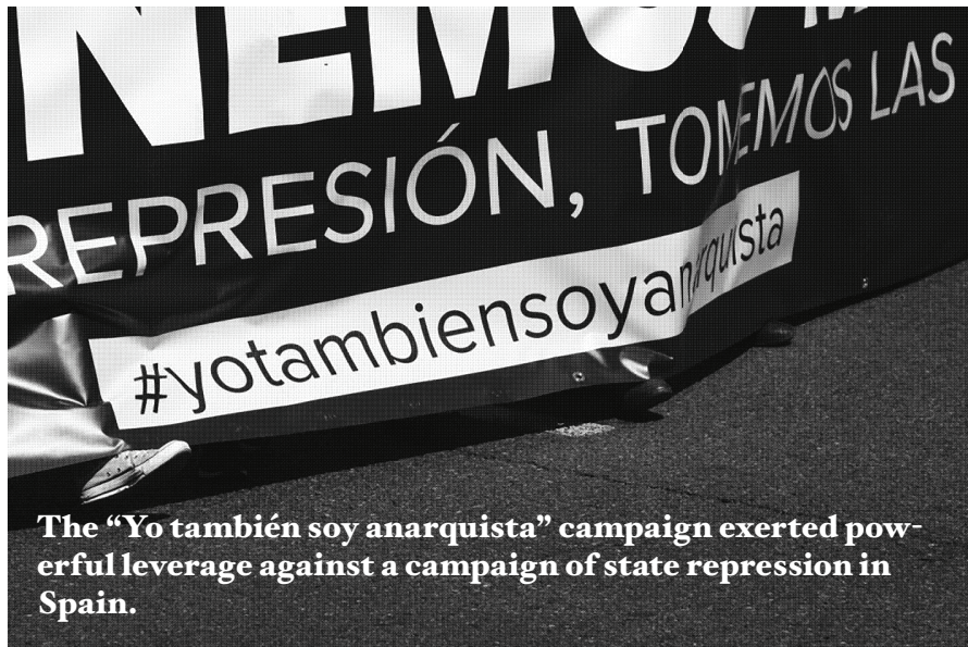
The “Yo también soy anarquista” campaign exerted powerful leverage against a campaign of state repression in Spain.

The case of the Asheville 11 shared some similarities with the J20 case. On the night of May Day 2010, 11 people arrested in the vicinity of a demonstration that involved property destruction were charged with vandalism, rioting, and conspiracy based on scant evidence. After a harrowing ordeal, the prosecution dropped most of the charges and a couple defendants took plea deals for “misdemeanor riot.” Years of